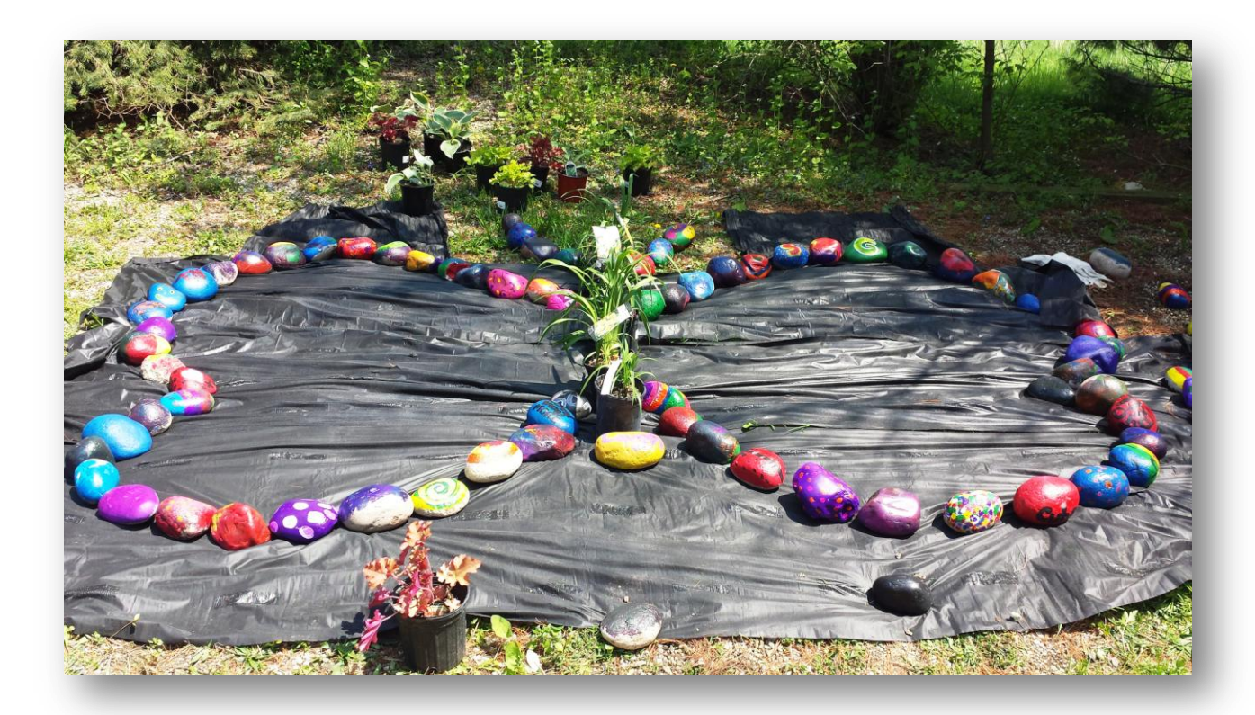
Start of a Landscaping Project at the SELF Building by Morgan Twp. Horticulture class.

It's what the Stoics call, "the premeditation" — that there's actually a lot of peace of mind to be gained in thinking carefully and in detail and consciously about how badly things could go. In most situations you're going to discover that your anxiety or your fears about those situations were exaggerated.